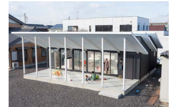
2017, Private House