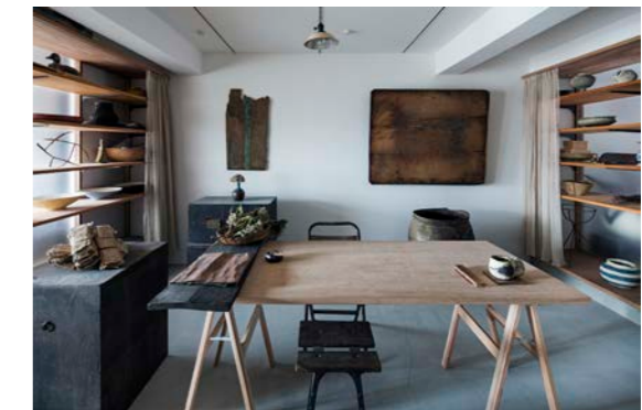
2016, Private House (Renovation of a single condominium unit)