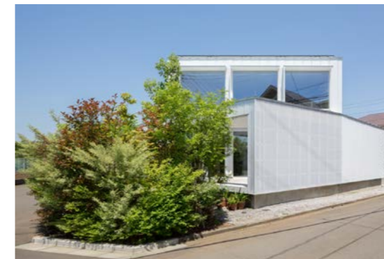
2016, Private House