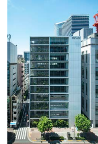
2020, Tenant Office