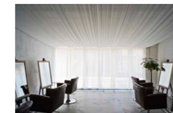
2013, Hair Salon