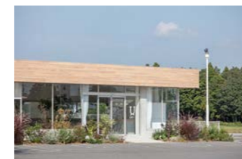
2021, Hair Salon