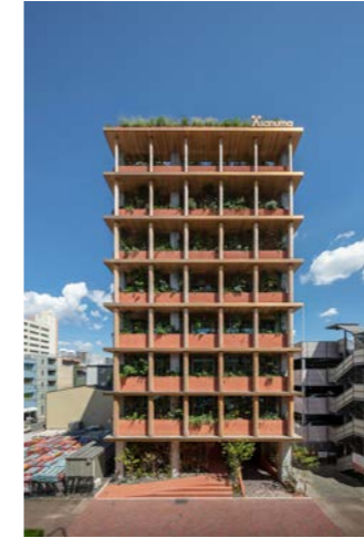
2021, In-house Office (Renovation)