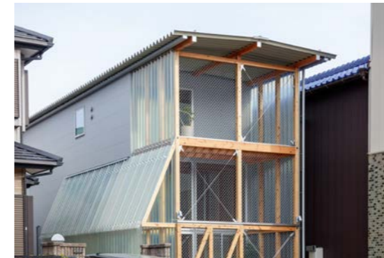
2022, Private House