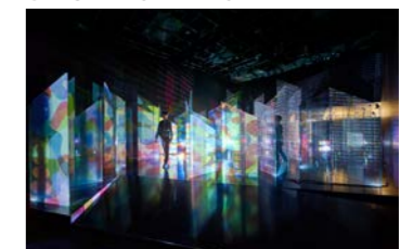
2015, Art Installation in Mialano Salone 2015